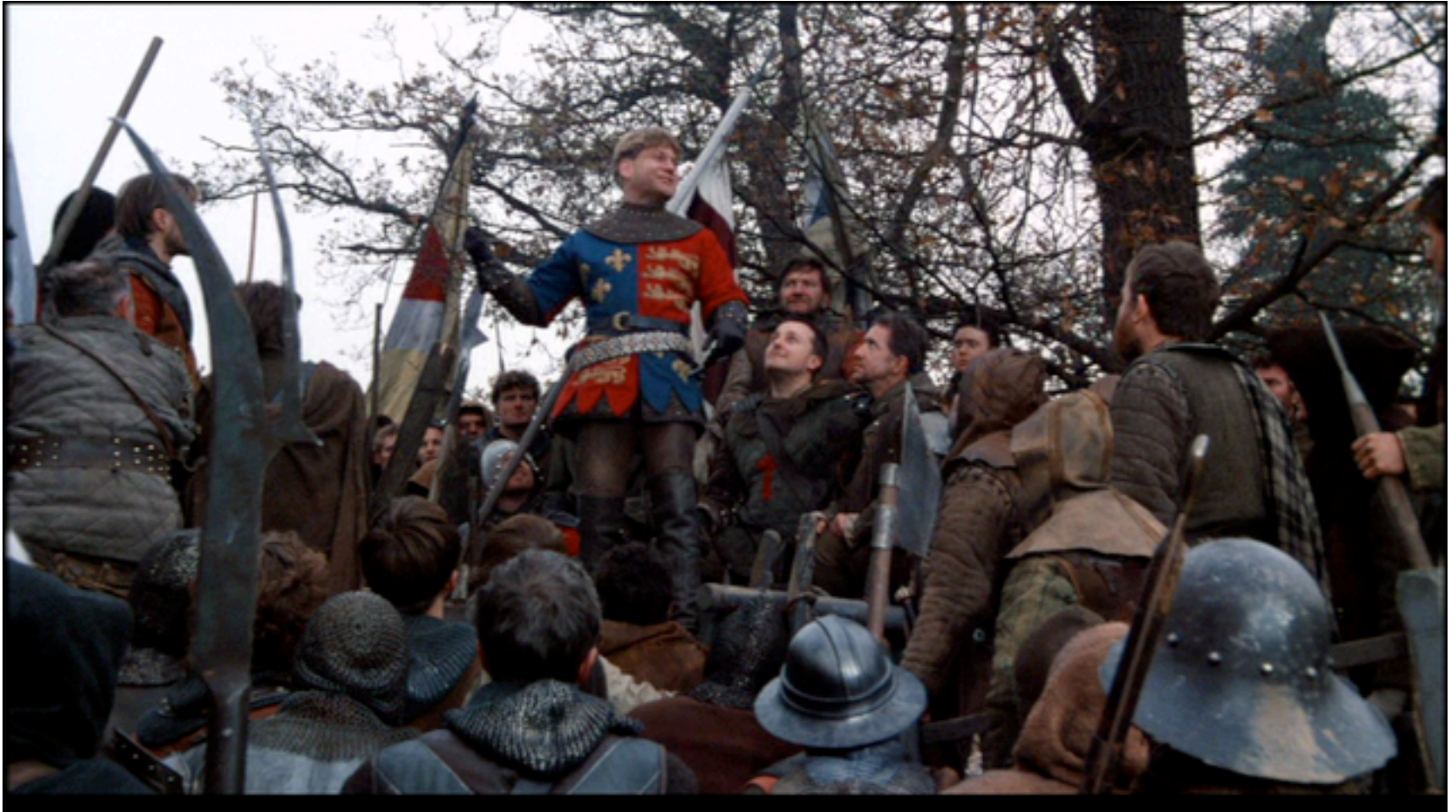
Still from Henry V (1989 film. Directed by Kenneth Branagh. BBC Films)